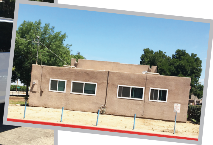
Parlier Migrant Center, housing